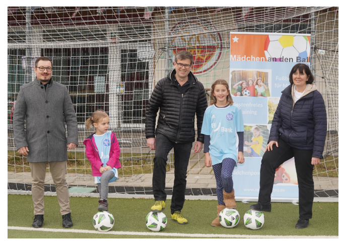
"Mädchen an den Ball" ("Girls kicking it")

While the "Mädchen an den Ball" ("Girls kicking it") project of the Munich Education and Culture Association (BIKU e.V.) will continue at Moving Child's Munich location until mid-2024, the funding of "Mädchen an den Ball" at the Bochum location has now come to an end.