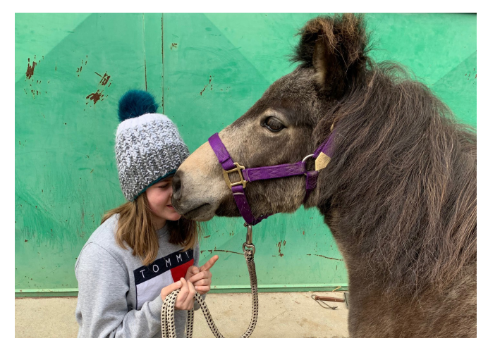
Paulihof – Kinderhilfe gGmbH, Kühbach