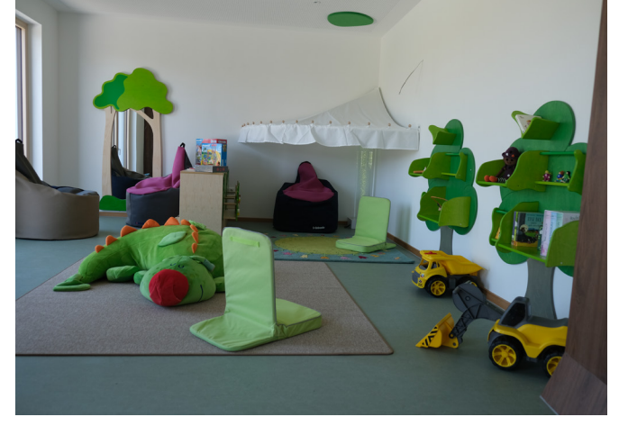
Children's hospice House ANNA, Eichendorf