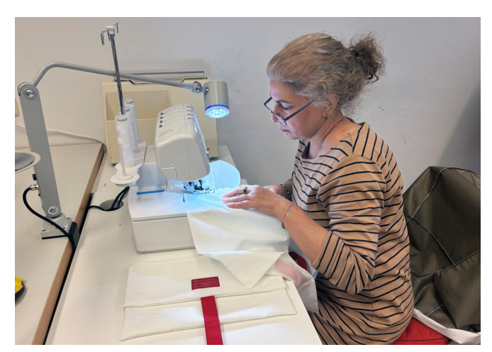
Netzwerk Geburt und Familie e. V., Munich Sewing workshop