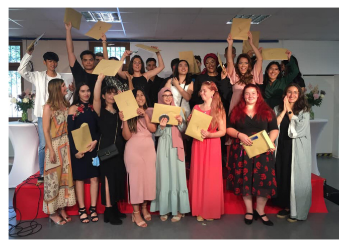
Quinoa School, Berlin-Wedding