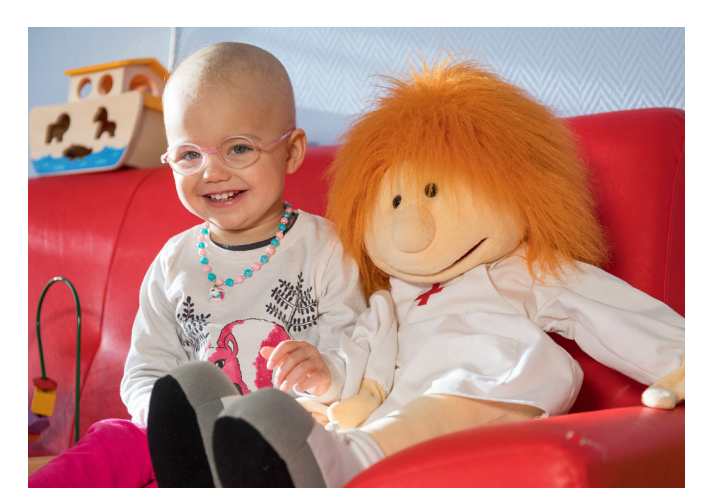
Children's cancer ward at Munich Clinic Schwabing