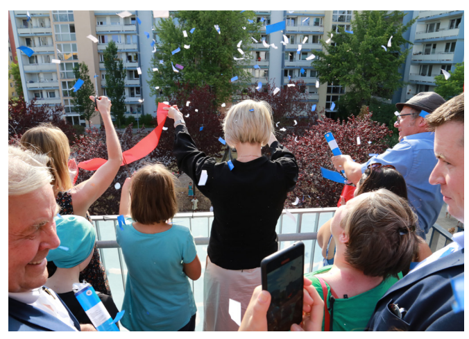
Campus di Monaco, Munich

We also used 2023 to visit our projects in Munich and Berlin, which gave us an in-depth insight into their day-to-day work. Video conferences and (information) events rounded off the closeness we seek and maintain with our projects.