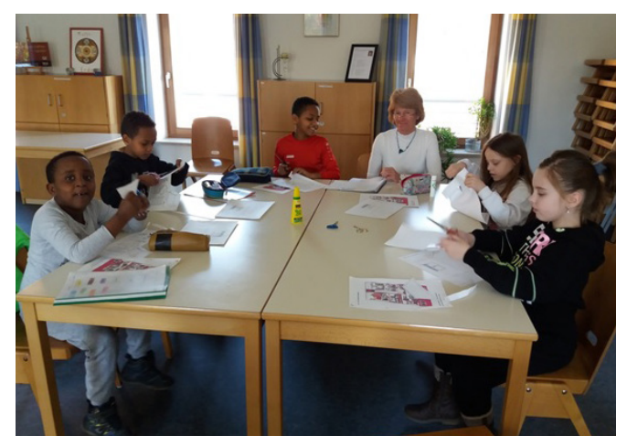
MiBiKids e. V., Freising