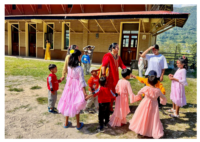
Hands with Hands, Nepal

For the 8<sup>th</sup> time now, we took part in the anniversary celebration of the Laos Friends Hospital for Children in Luang Prabang . Each time we are deeply touched by the immense amount of work and passion that the doctors, nursing staff and all employees put into the project. Last year, it was clear to see that the medical work is now being intensified. Since 2019, Moving Child has been supporting the hospital's child health education program in particular. The sustainable concept of in-house teaching and educational events has fascinated us from the very beginning. The main aim of the education program is to strengthen the autonomy and independence of Laotian doctors and nursing staff. This paves the way for the hospital to be run by them alone from 2030..