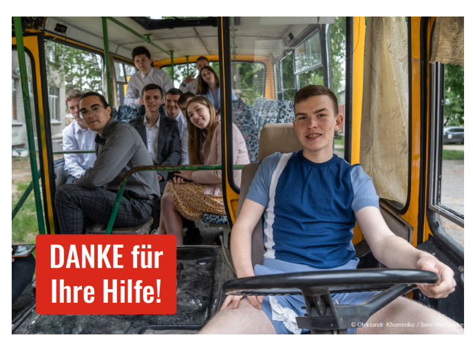
Save the Children, Emergency aid for Ukraine