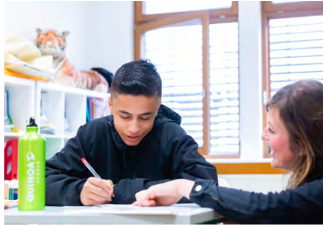
Quinoa School, Berlin-Wedding