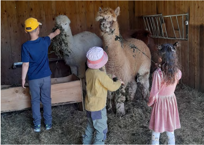
Munich Outpatient Children's Hospice Foundation (AKM)