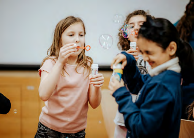
MiBiKids e. V., Freising