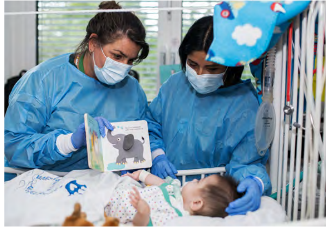
Care-for-Rare Foundation at the Dr. von Hauner Children's Hospital