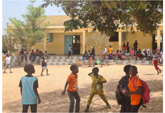
International Family Aid Senegal (InFa)