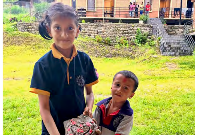
Hands with Hands, Nepal