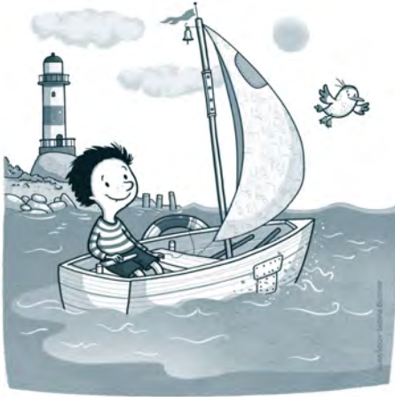
AETAS Children's Foundation, Munich