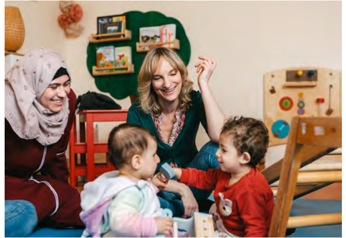
Family center "Die Brücke", Berlin