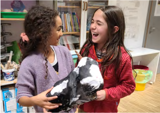
Campus di Monaco, Munich