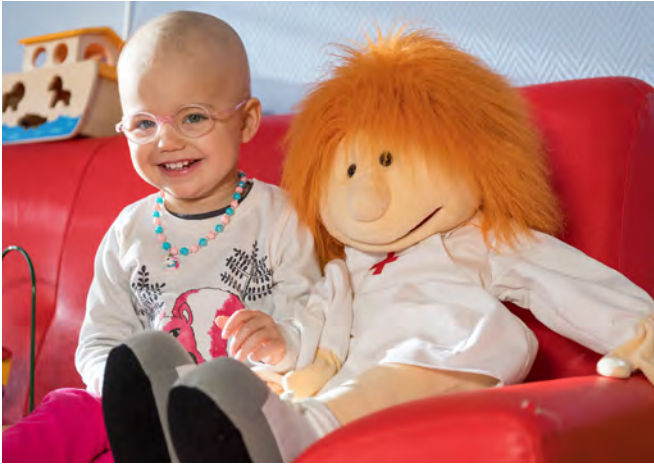
Children's cancer ward at Munich Clinic Schwabing