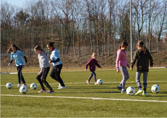
„Mädchen an den Ball“, BIKU Munich