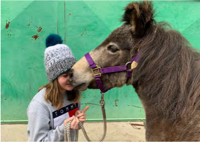
Paulihof – Kinderhilfe gGmbH (Children's Aid), Kühbach