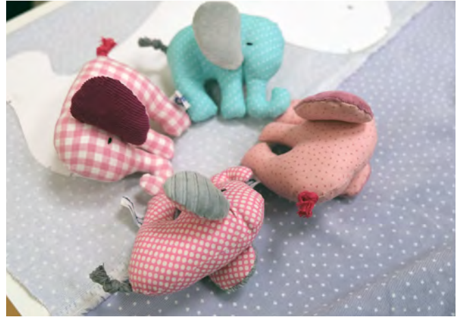
Birth and Family Network e. V., Munich