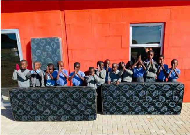
Outjenaho – bright children's eyes e. V., Namibia