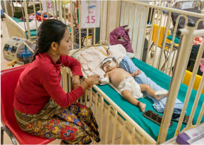
Laos Friends Hospital for Children, Luang Prabang