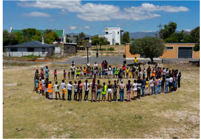
Positiv Leben e. V. – Vulamasango and Vulingoma, South Africa